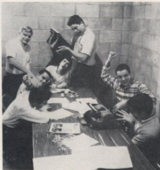
FRENZIED BY THEIR EFFORTS to publish this issue in a scant four days, the Editors find themselves entrapped in the Satanic Predicament as Pandemonium reigns in the publications room.